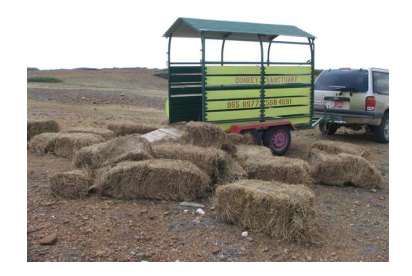
Hay for the herd of donkeys at Vader Piet

Our love for donkeys does not stop at the gates of the sanctuary: also the wild donkeys deserve our attention. During the past two months, two trainees from Holland have studied these donkeys and their behavior. We find it most important to know how many of these animals are still around in the wild, and whether there is inbreeding due to the fact that the herds are so small. Also we want to know whether certain measures should be taken to prevent resulting problems of this in the future.